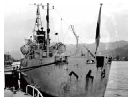
▶Japan Coast Guard patrol vessel fired at near Takeshima by the Republic of Korea in July 1953.