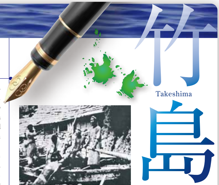
▲Takeshima Fishery Company around 1909.

Japan and the Republic of Korea have built a relationship of trust through activities such as jointly hosting the 2002 FIFA World Cup. In order to establish genuine, friendly relations between the two nations, Japan will continue to seek the settlement of its dispute in the basis of international law in a calm and peaceful manner.