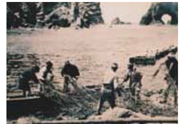
▶Japanese fishermen actively involved in fishing on and around Takeshima. (1930s)

in the Declaration. As regards the island of Bokdo, otherwise known as Takeshima or Liancourt Rocks , this normally uninhabited rock formation was according to our information never treated as part of Korea and, since about 1905, has been under the jurisdiction of the Oki Islands Branch Office of Shimane Prefecture of Japan. The island does not appear ever before to have been claimed by Korea. It is understood that